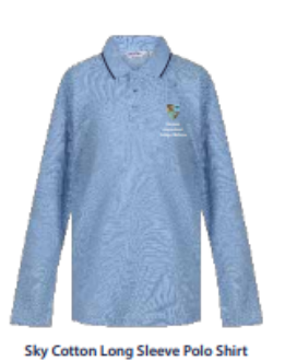
PCL-SKY Navy Collar Tipping and Badge to PS1