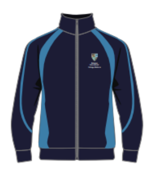
Navy/Cyclone Pro Track Jacket APRJ-NCY Badge to SC1