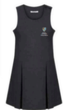
Harrow Grey Panel Pinafore JPP-HGY Badge to PN3

All designs, text, graphics, information relating to garments, product specifications and size charts are Copyright to Trutex 2024