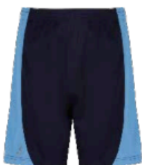
Navy/Cyclone Sector Short ESH-NCY