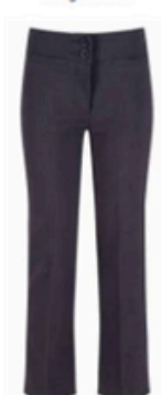
Graphite Junior Girls Fit Trousers JGTN-GRA