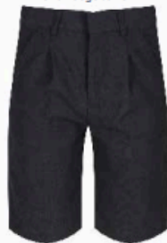
Grey Junior Short SPS-GRY