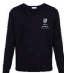
Navy Cotton V-Neck Jumper CBV-NVY Badge to KN1