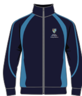
Navy/Cyclone Pro Track Jacket APRJ-NCY Badge to SC1