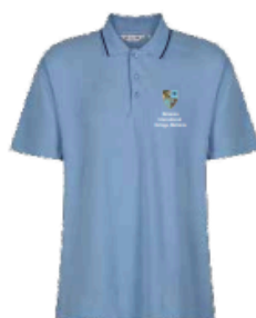
Sky Cotton Short Sleeve Polo Shirt PCH-SKY Navy Collar Tipping and Badge to PS1