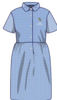
Blue Check Katie Collar Summer Dress SKB BWT/764 Badge to SD1

All designs, text, graphics, information relating to garments, product specifications and size charts are Copyright to Trutex 2024