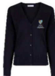
Navy Cotton Cardigan CGC-NVY Badge to KN3