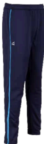
Navy/Cyclone Pro Track Pant PTP-NCY

All designs, text, graphics, information relating to garments, product specifications and size charts are Copyright to Trutex 2024