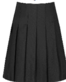
Harrow Grey Junior Pleated Skirt JGPB-HGY