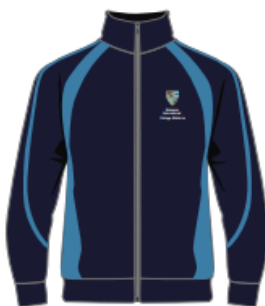
Navy/Cyclone Pro Track Jacket APRJ-NCY Badge to SC1