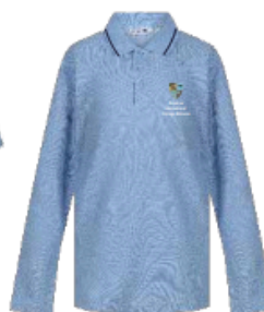
Sky Cotton Long Sleeve Polo Shirt PCL-SKY Navy Collar Tipping and Badge to PS1