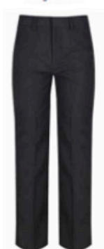
Grey Junior Boys Fit Trousers CFJ-GRY