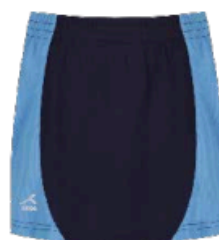
Navy/Cyclone Sector Skort ESK-NCY