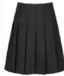
Harrow Grey Junior Pleated Skirt JGPB-HGY