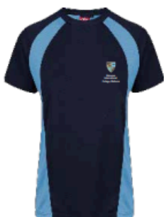
Navy/Cyclone Sector T-Shirt ECT-NCY Badge to SC1