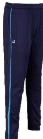
Navy/Cyclone Pro Track Pant PTP-NCY

All designs, text, graphics, information relating to garments, product specifications and size charts are Copyright to Trutex 2024