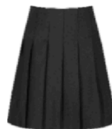
Harrow Grey Junior Pleated Skirt GJPB-HGY