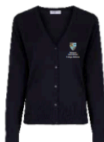
Navy Cotton Cardigan CCG Badge to KN3