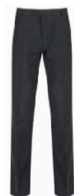
Grey Senior Boys' Fit Trousers TU-GRY