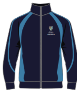
Navy/Cyclone Pro Track Jacket APRJ-NCY Badge to SC1