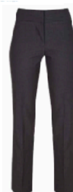
Graphite Senior Girls' Fit Trousers GTN-GRA

All designs, text, graphics, information relating to garments, product specifications and size charts are Copyright to Trutex 2024