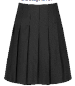
Harrow Grey Junior Pleated Skirt JGPB-HGY