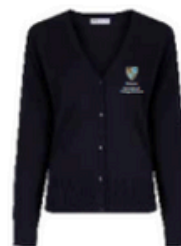
Navy Cotton Cardigan CGC-NVY Badge to KN3