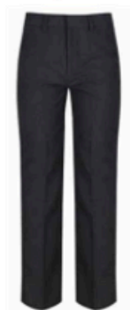
Grey Junior Boys Fit Trousers CFJ-GRY