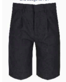
Grey Junior Short SPS-GRY