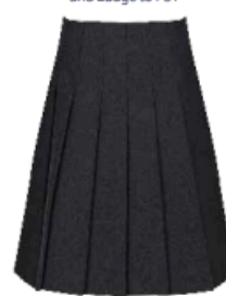
Harrow Grey Senior Pleated Skirt GPB-HGY

All designs, text, graphics, information relating to garments, product specifications and size charts are Copyright to Trutex 2024