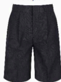
Grey Senior Short TSH-GRY