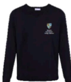
Navy Cotton V-Neck Jumper CBV Badge to KN1