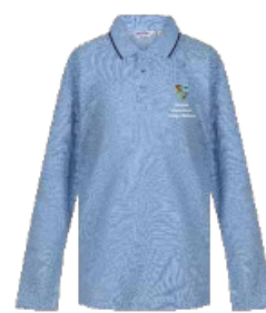
Sky Cotton Long Sleeve Polo Shirt PCL-SKY Navy Collar Tipping and Badge to PS1