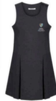
Harrow Grey Panel Pinafore JPP-HGY Badge to PN3

All designs, text, graphics, information relating to garments, product specifications and size charts are Copyright to Trutex 2024